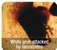
White grub attacked by nematodes